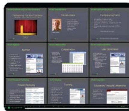
→ New thumbnail views for easy browsing.